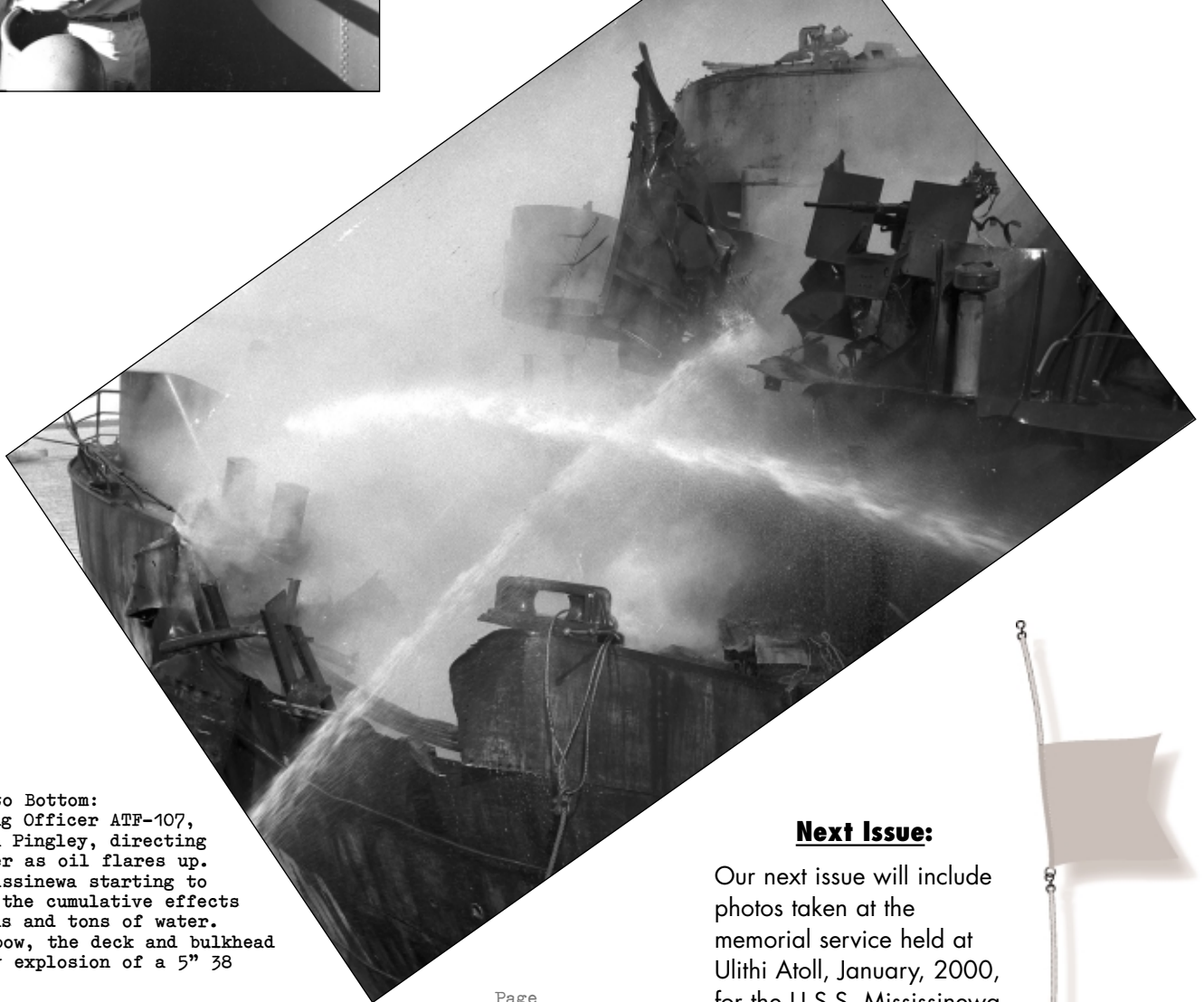
Photos Top to Bottom: 1. Commanding Officer ATF-107, Captain John Pingley, directing play of water as oil flares up. 2. The Mississinewa starting to settle from the cumulative effects of explosions and tons of water. 3. Off the bow, the deck and bulkhead blown out by explosion of a 5" 38 magazine.