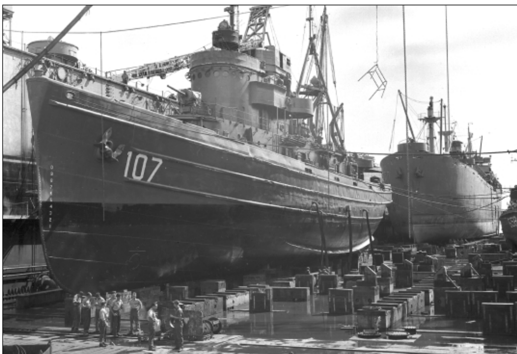
This photograph shows the U.S.S. Munsee, ATF-107, in an Advance Base Sectional Drydock (ABSD) at Guam for repairs in July 1945.