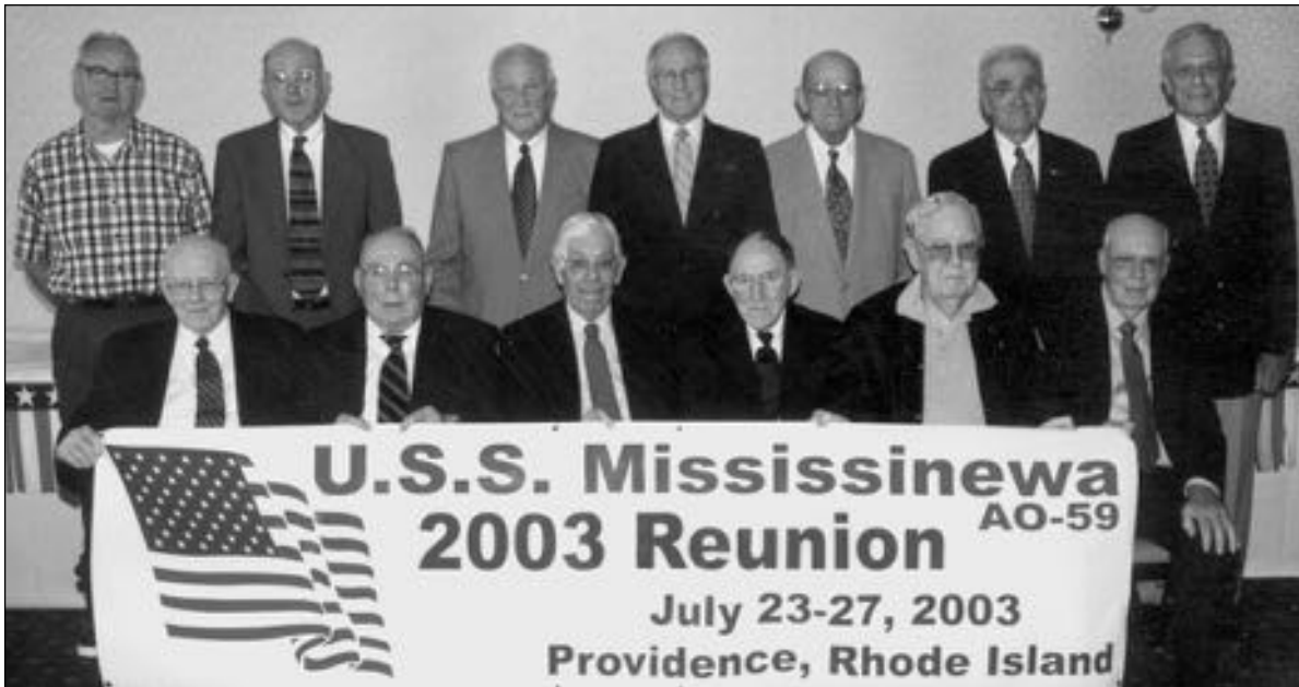
From Left to Right - Top Row